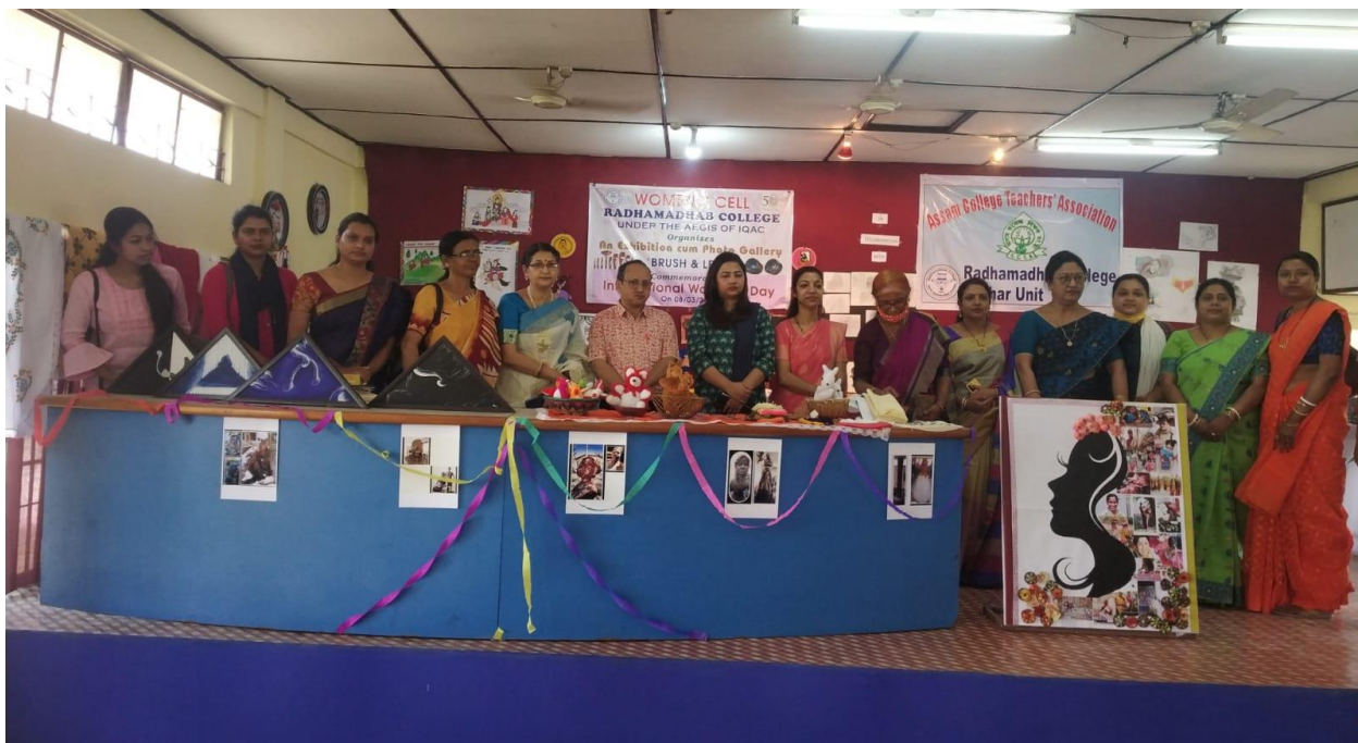
Exhibition cum Photo Gallery titled "Brushes and Lenses" on 08/03/2022