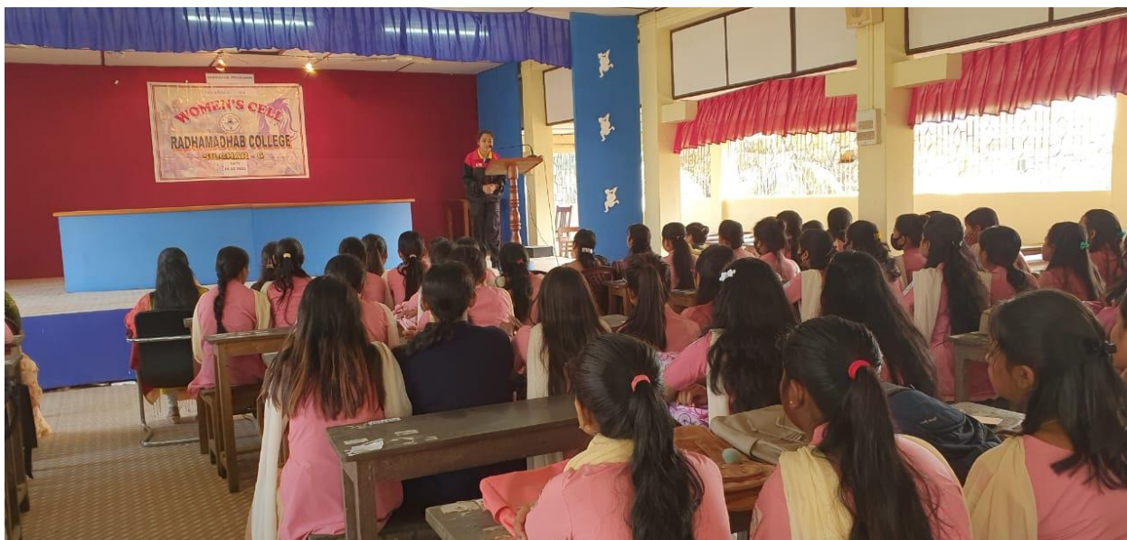
An Orientation Program for Female Students of the College on 16/12/2022