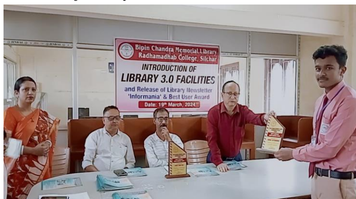
Library Best User Award given to student for the year 2022-23