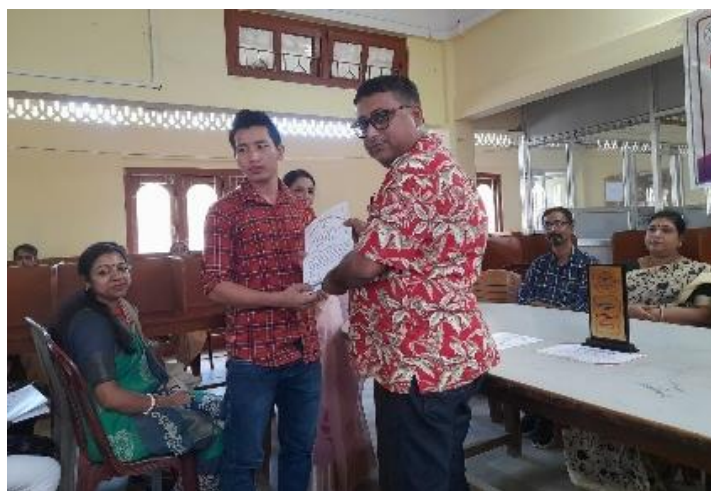
Library Best User Award given to student for the year 2021-22