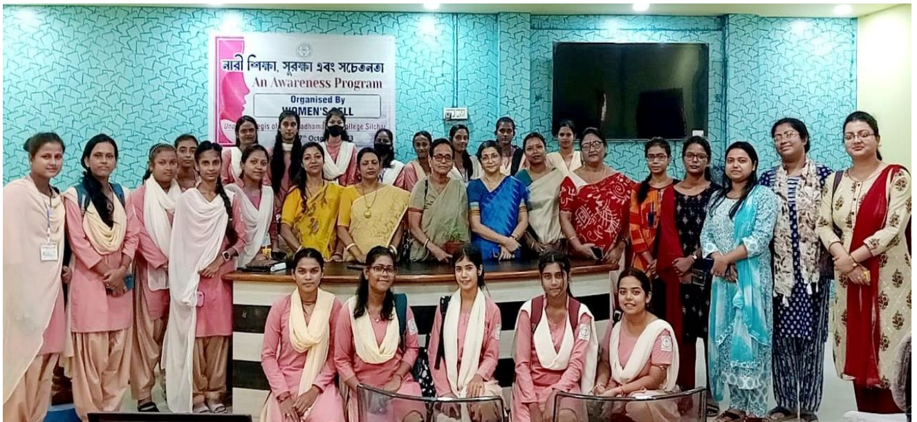
An Awareness Programme on "Nari Siksha, Suraksha and Sachenata" on 17/10/2023