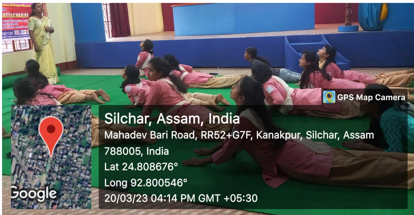
A Women's Special Yoga Session on 20/03/2023