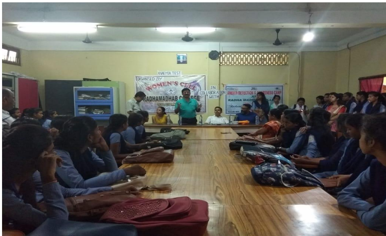
An “Anemia Testing Program” on 09/09/2019