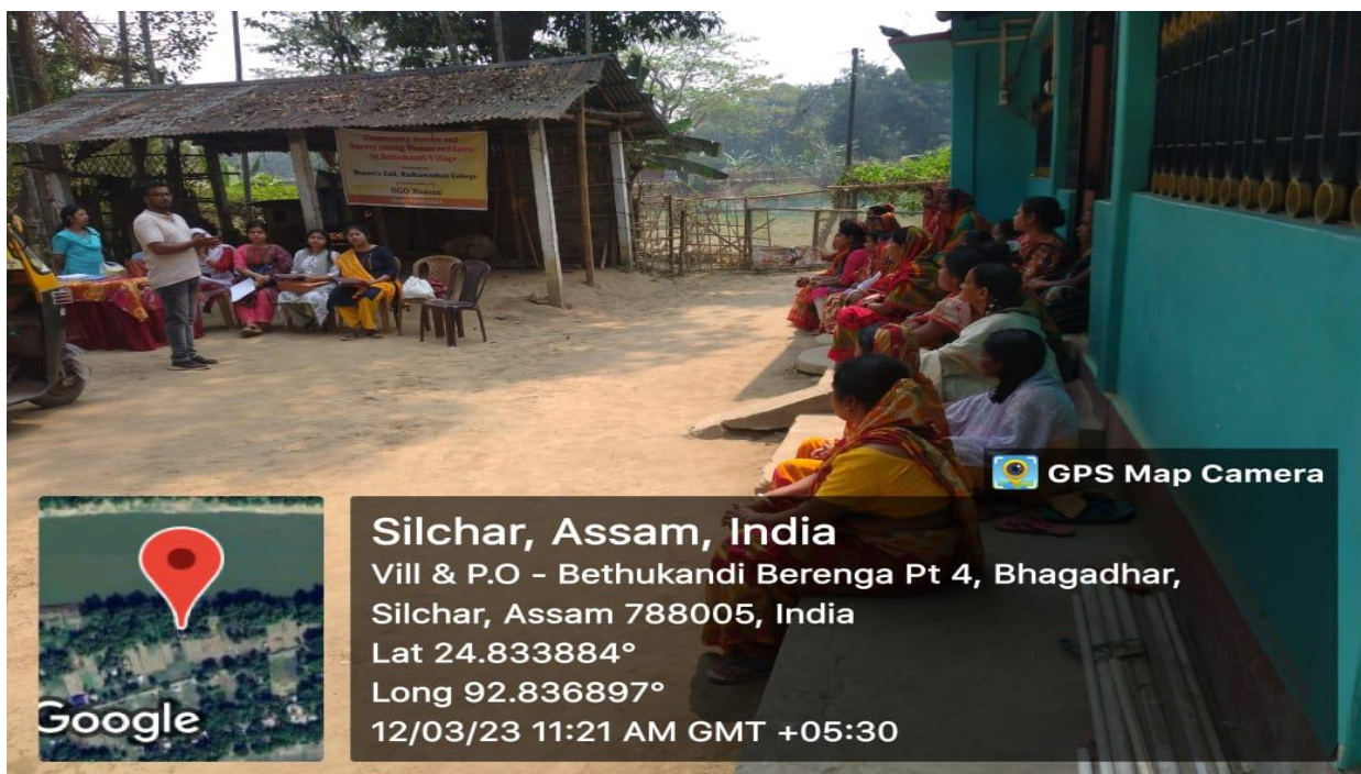
A Community Service and Survey among the women residents in Bethukandi village on 12/03/2023