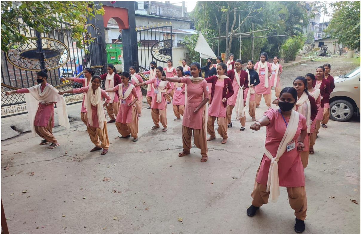
Female Students practising Taekwondo