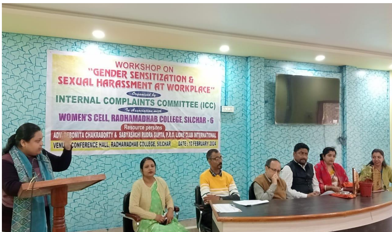
Workshop on 'Gender Sensitization and Sexual Harassment at Work Place' on 10/02/2024