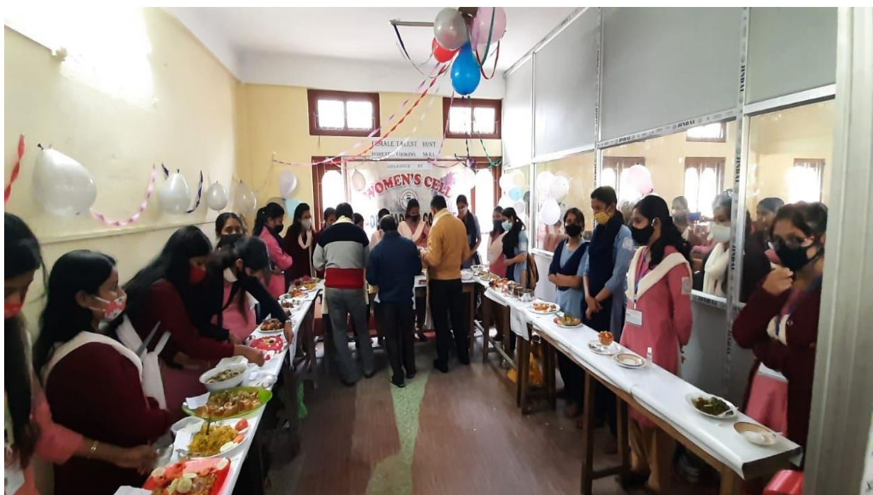
Female Talent Hunt Programme on 29/01/2022