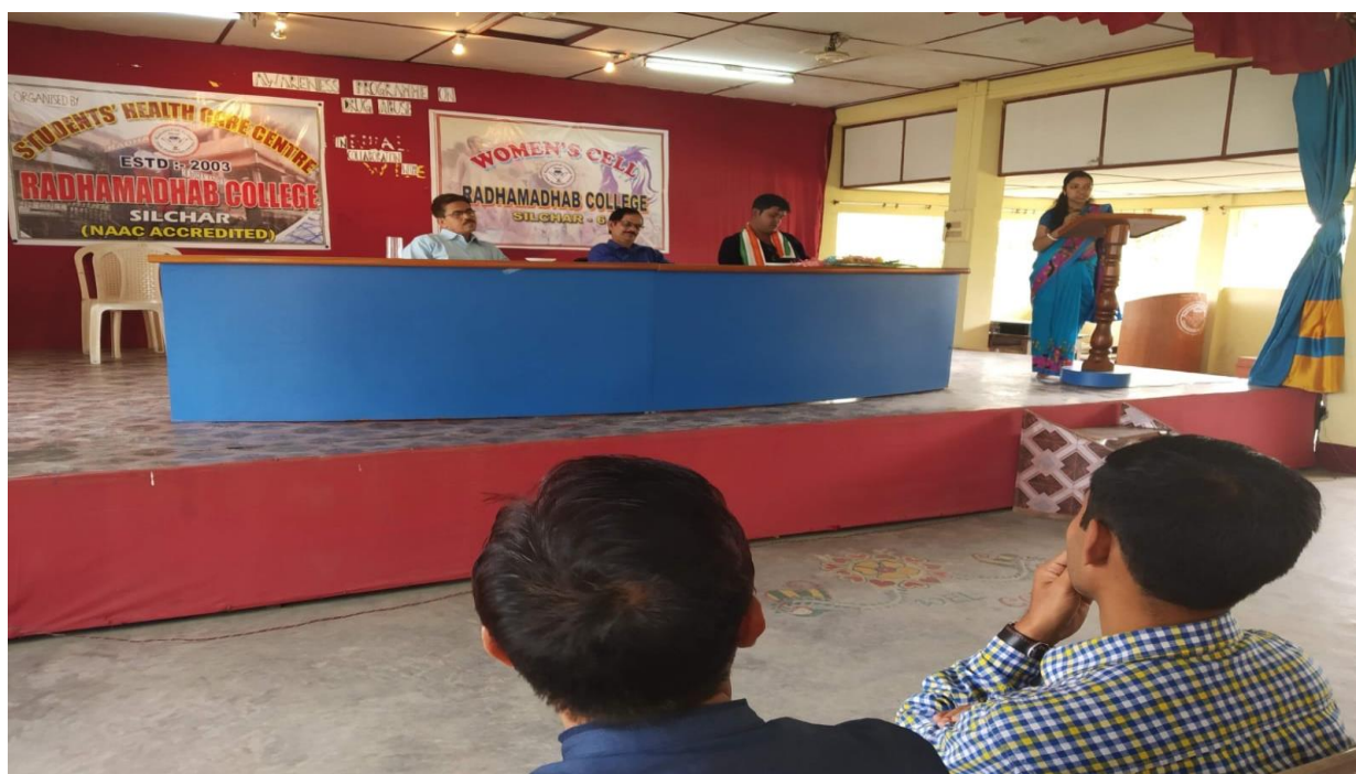
An Awareness Program on “Drug Abuse” on 18/03/2019