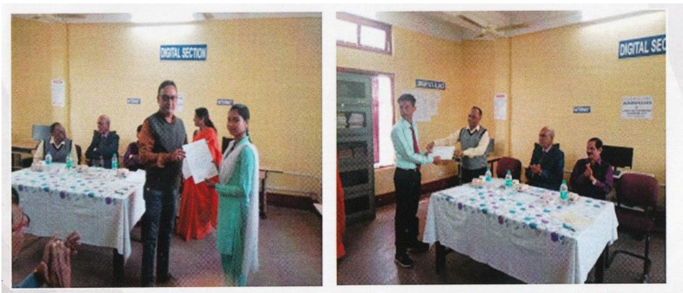
Library Best User Award given to student for the year 2019-20