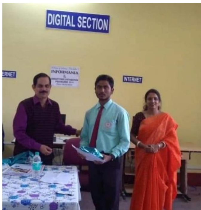
Library Best User Award given to student for the year 2018-19