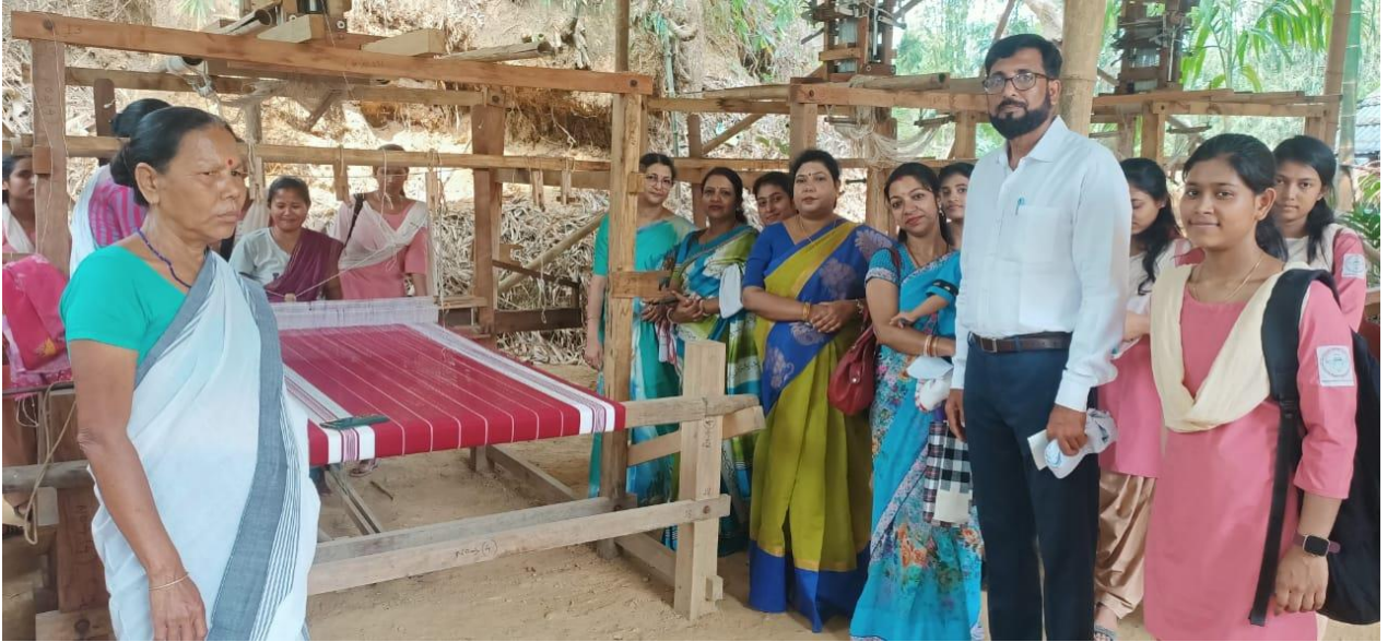
A field trip/exposure visit to Handloom (Weaving) Centre, Borkhola on 25/03/2023

TITLE: JAGAT JANANI: AN ENDEAVOUR TO EMPOWER WOMEN