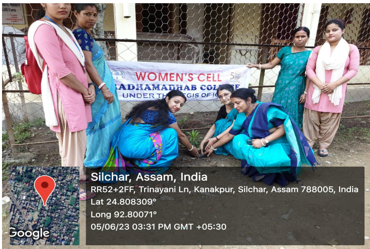
Plantation Programme on World Environment Day (05/06/2023)