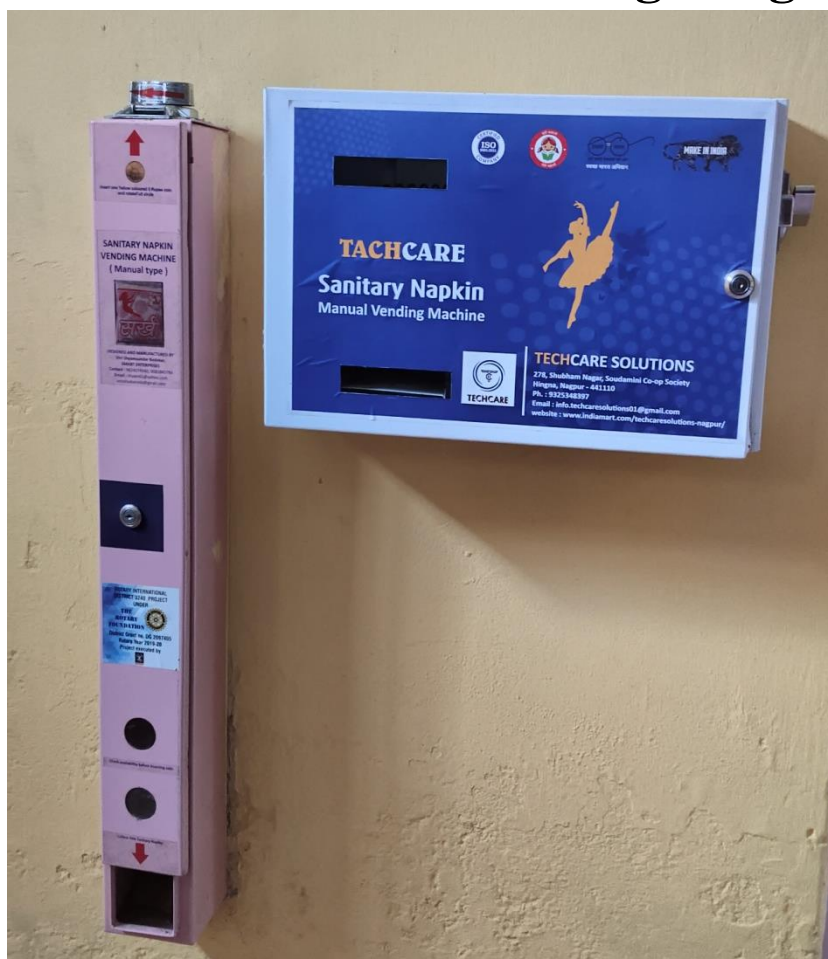
Vending Machine at Girls' Common Room