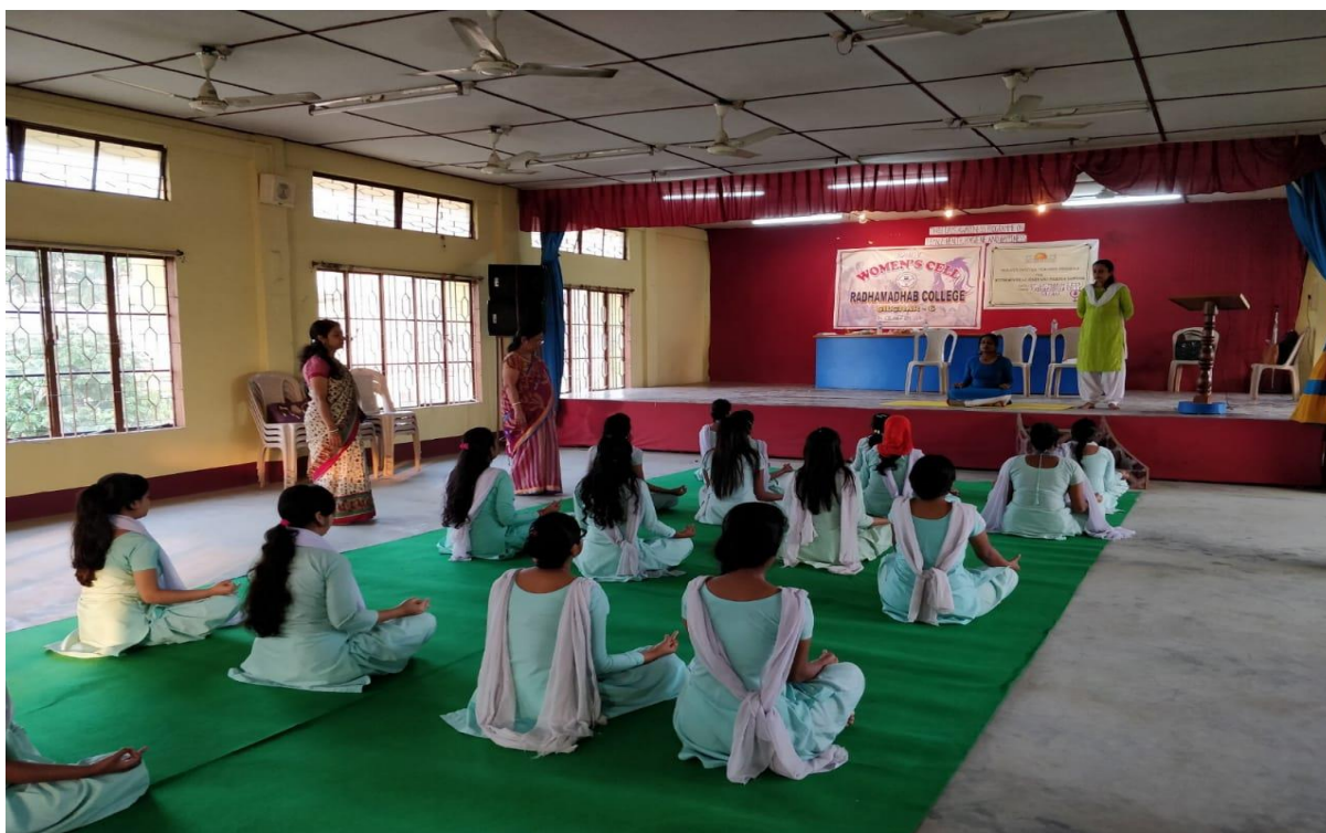
A three-day Meditation Programme on “Female Health and Hygiene” from 07/03/2019 to 09/03/2019