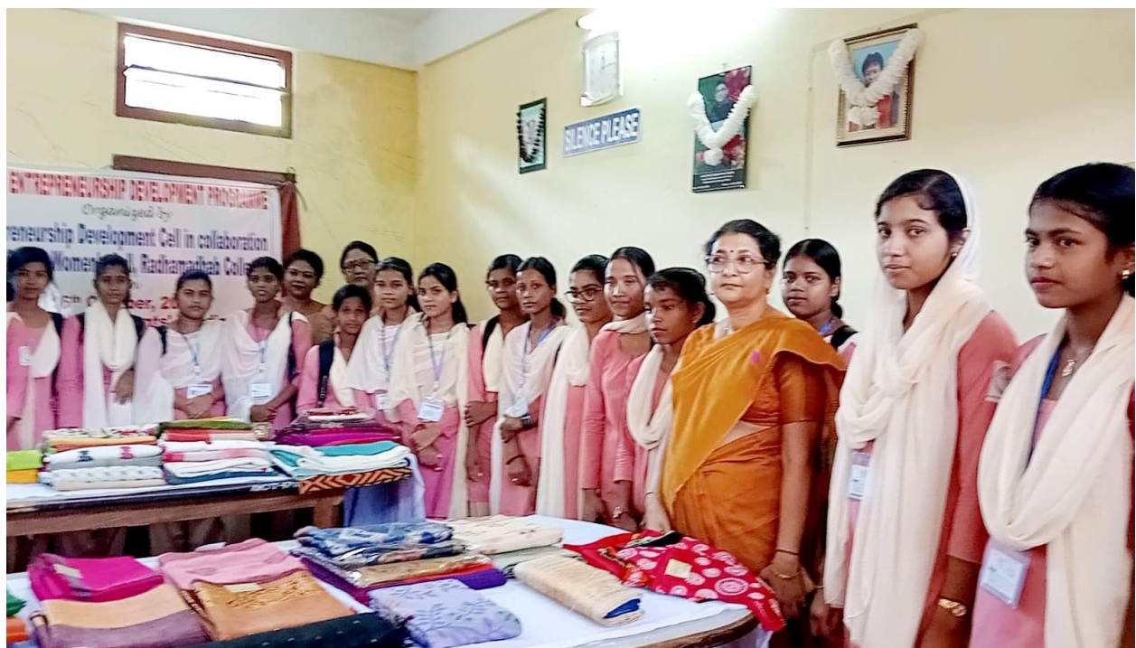
An exhibition cum sale event on 16/10/2023