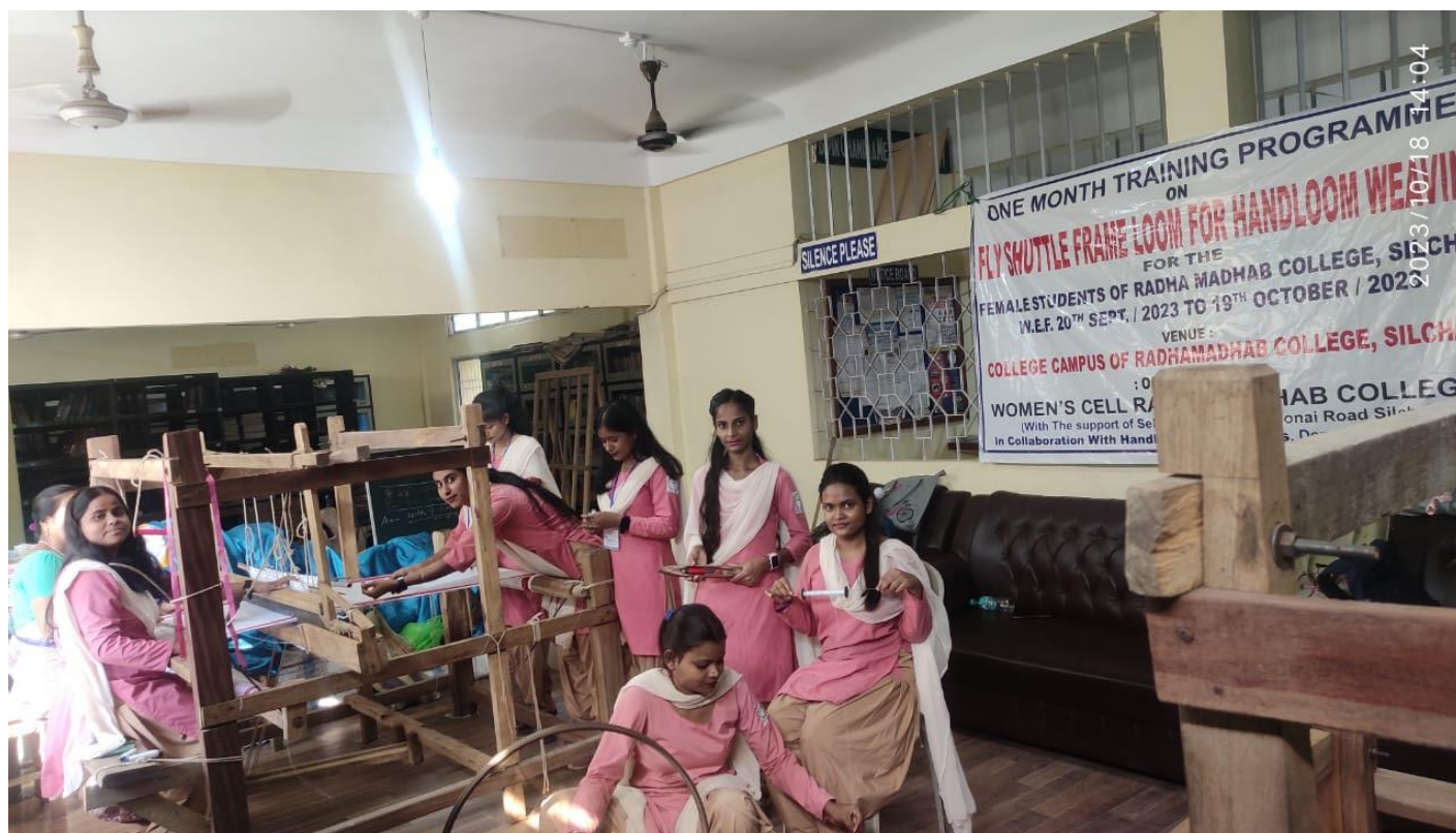
One Month Training Course on "Handloom Weaving" from 20/09/2023 to 19/10/2023